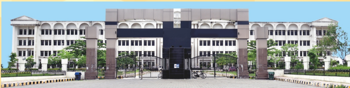
RTM Nagpur University Jammalal Bajaj Administrative Campus front Gate

Our association with AIU youth affairs from long years. RTM Nagpur University has great legacy of hosting AIU youth festival. We hosted AIU Zonal youth festival three times (1991-92, 1997-98, 2001-02) and National youth festival three times (1992-93, 1999-2000, 2011-12).